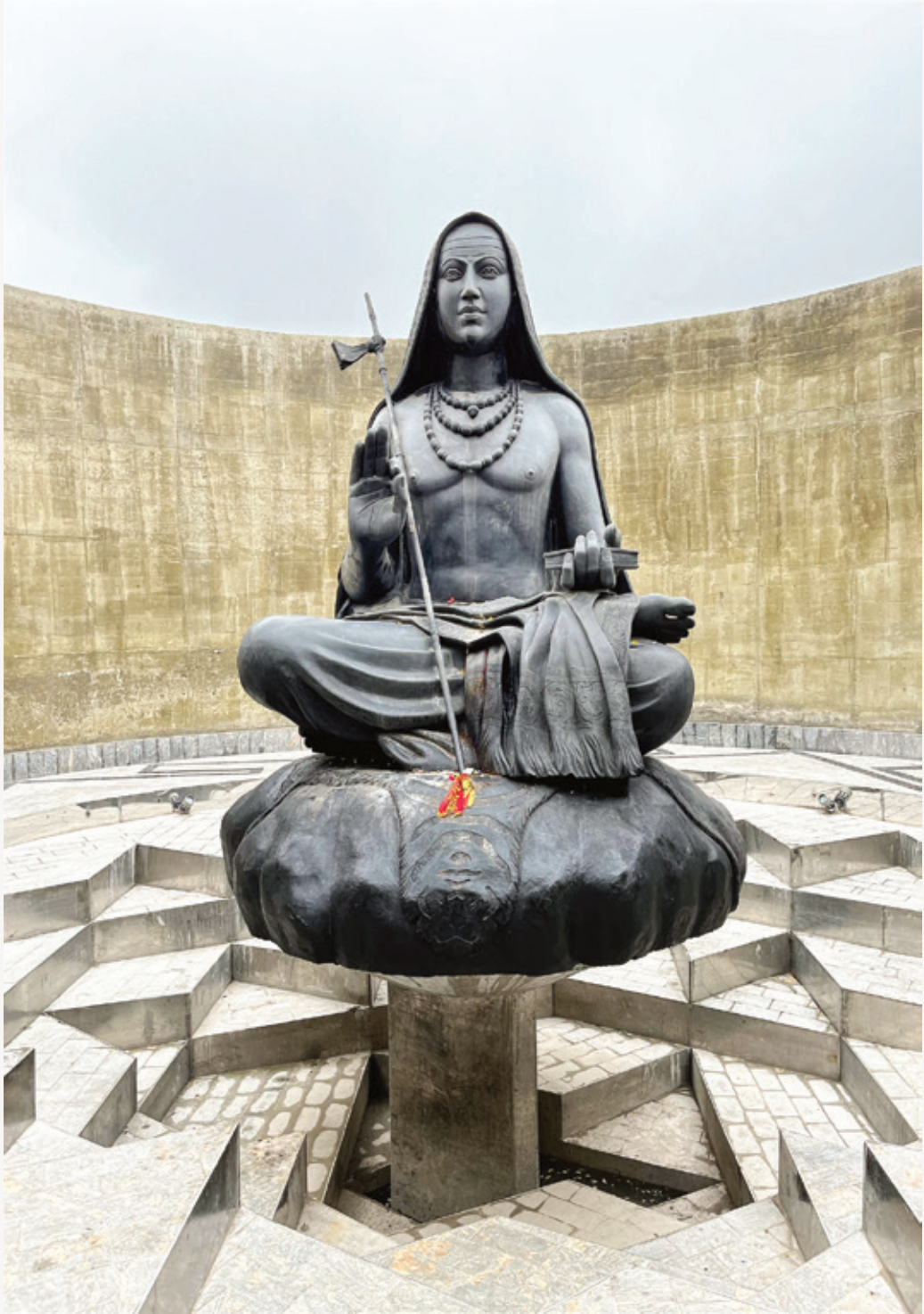
Adi Śaṅkara statue at Kedārnath Temple